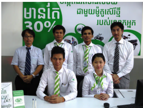
Launching staff at new sales office

As a pioneer and only motorcycle finance company of Cambodia, GLF expect to gain the customers recognition steadily by launching their sales office quickly in Phnom Penh.