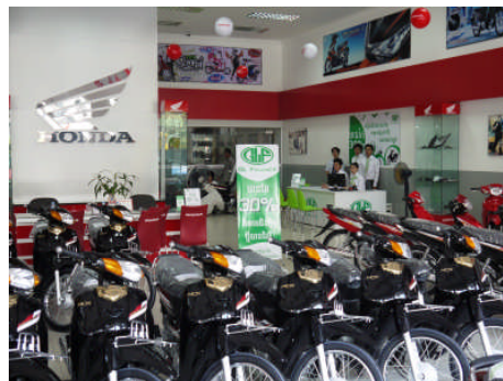
HONDA motorcycles lined at dealer