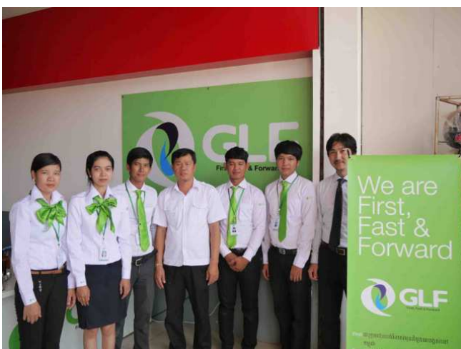
Owner of HONDA SOK EAN & GLF Staffs