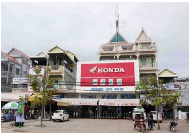
Owner of HONDA SENG HOUT & GLF Staffs