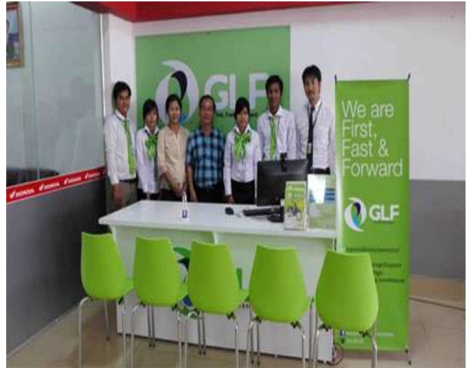
Operating Regions after Establishment in HONDA SENG HOUT and HONDA SIEM REAP1