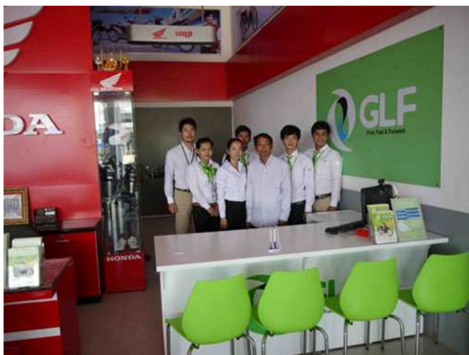
Owner of HONDA PREAH VIHEAR & GLF Staffs