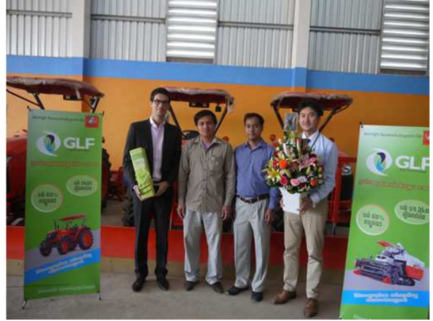
Owner of TAN LONG CHEA & GLF