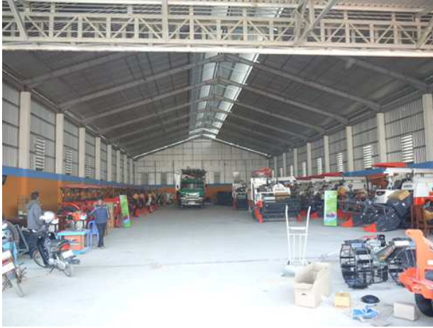
TAN LONG CHEA Dealer Store