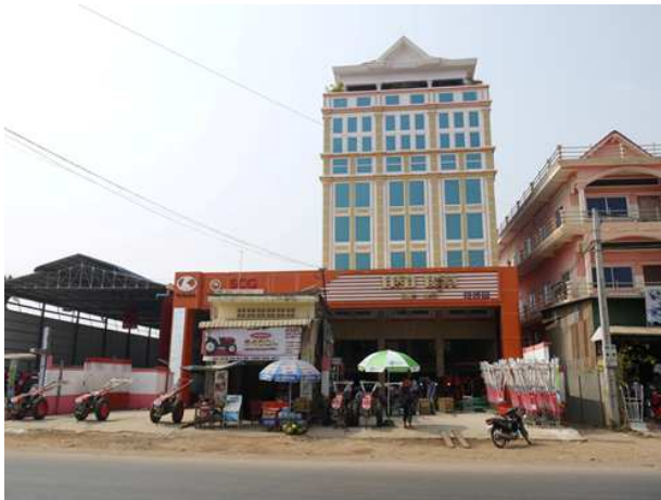
ENG HOK Dealer Store