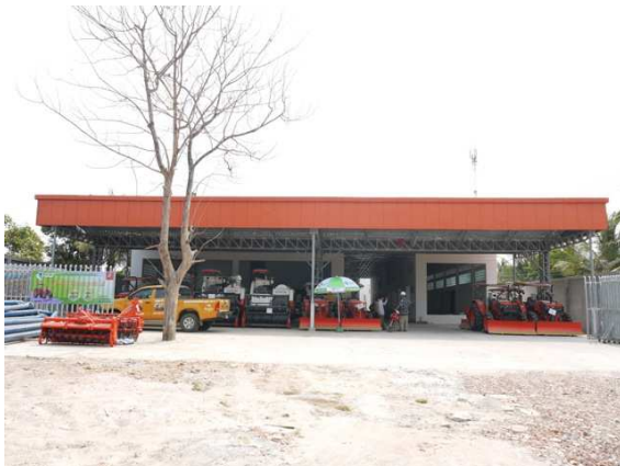
SORN CHEA Dealer Store