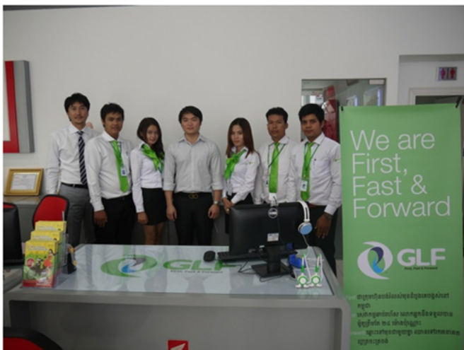
Owner of HONDA MEAN LEAP & GLF Staffs