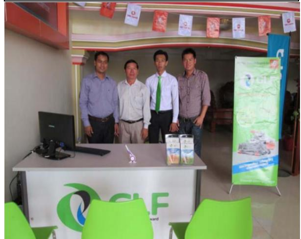
Owner of KUBOTA ENGHOK & GLF Staff