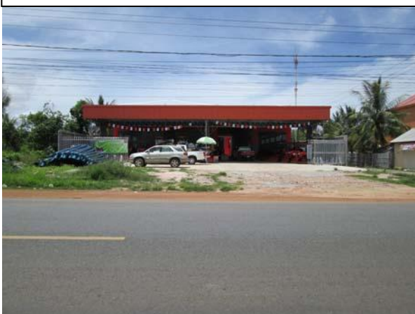
KUBOTA SORN CHEA