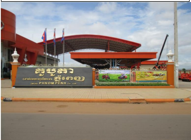
KUBOTA dealer SENG LENG