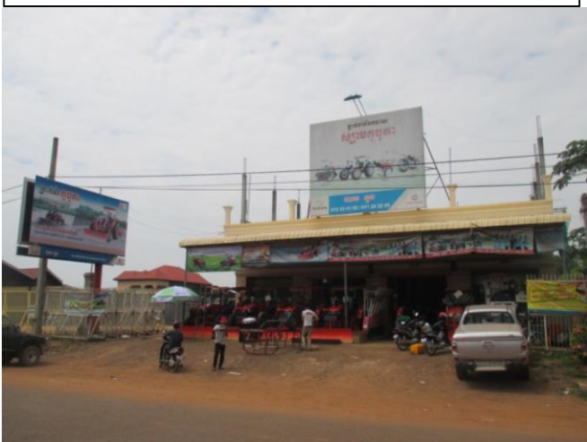
KUBOTA dealer SENG TOUCH