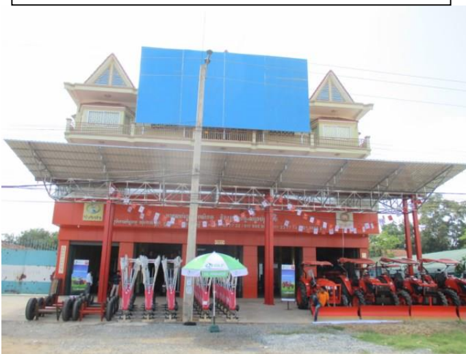
KUBOTA dealer SENG HUY