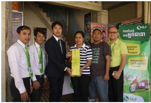
HONDA Por Leap