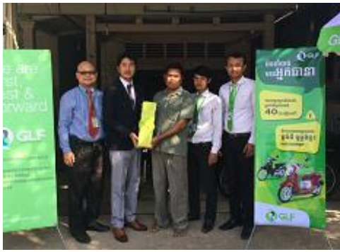
HONDA Un Bona