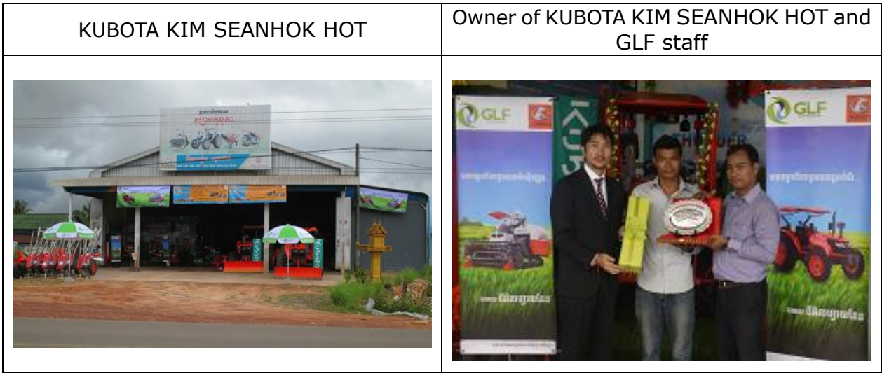
Operating Regions of GLF Agricultural Machines after Establishment of KUBOTA KIM SEANHOK HOT