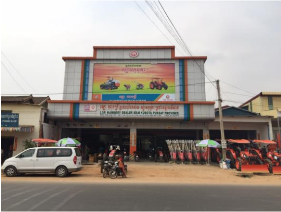
KUBOTA LOR HANGKRY