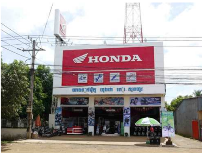
HONDA TENG SOKHOUR Dealer Store