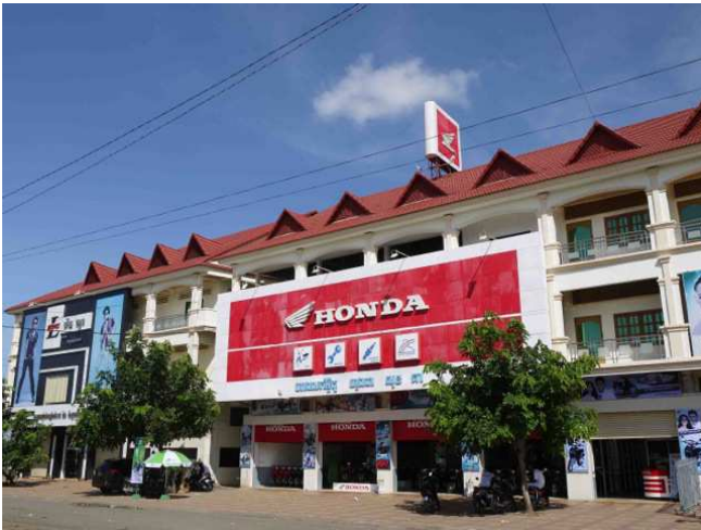
HONDA SOK KEA Dealer Store