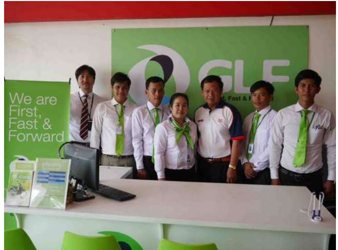
Owner of HONDA SOK KEA & GLF Staffs