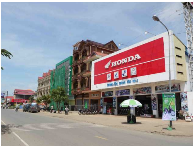
HONDA KIM HENG Dealer Store