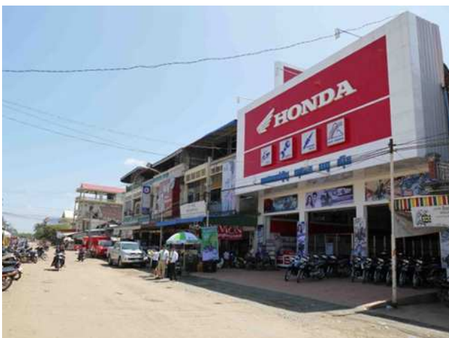
HONDA CHHOUR SUN Dealer Store