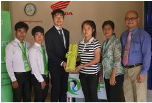
HONDA Huy Houk Thma Koul